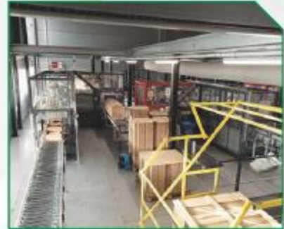
Durrenberg's solution allowed greater packing density.

To help overcome the challenge of handling the machines up and onto the mezzanine, Durrenberg subcontracted